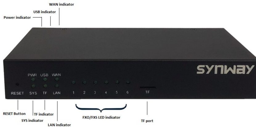
Figure 1 ISS MICRO UCR